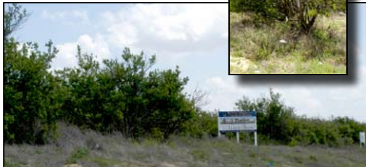
Examples of abandoned groves throughout the state